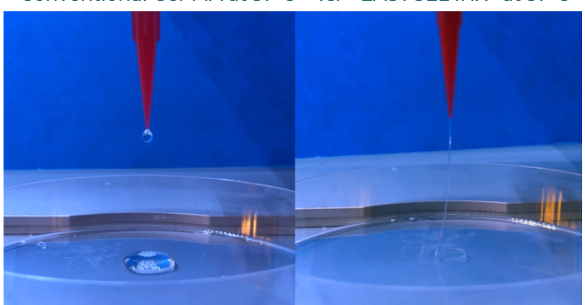
Conventional Gel-MA at 37°C vs. EASYGEL INX<sup>®</sup> at 37°C

EASYGEL INX<sup>®</sup> X100 combines all the benefits of conventional gelatin / Gel-MA based inks with a highly improved printing process thanks to its shear thinning behavior. As a result, it can be printed in a straightforward and reproducible way at 37°C both in the presence or absence of cells (Figure 1). In this respect, it overcomes the narrow processing range limitations associated with printing a conventional Gel-MA based ink.