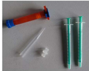
Preheat GEL-MA INX cartridge at 37 °C.