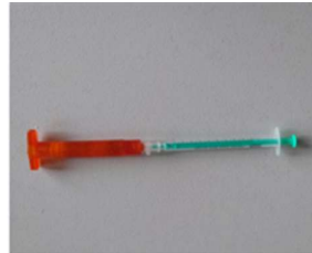
Connect GEL-MA INX cartridge to a syringe via a female luer-to-luer adapter.