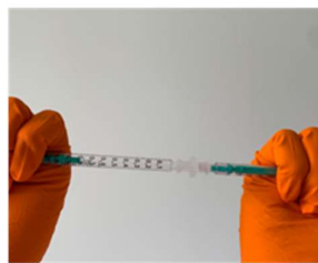
Connect the second syringe containing the cell suspension via a luer-to-luer adapter. Shift the hydrogel back and forth between the syringes until the cells are homogeneously mixed in.