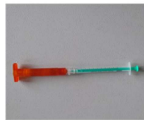
Inject cell-laden GEL-MA INX back into the cartridge via a luer-to-luer adapter.