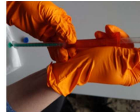
Inject the desired amount of GEL-MA INX into the syringe.